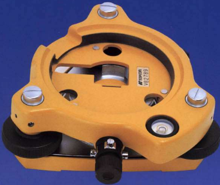
TRIBRACH-10 with OPTICAL PLUMMENT