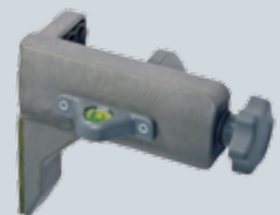
C50 Clamp included with CR600 receiver