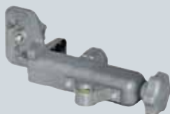
HL700 and HL750(U) includes clamp with Bubble Vial PN AT1400103-01V