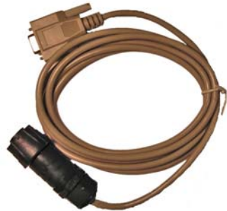
Serial Port Cable