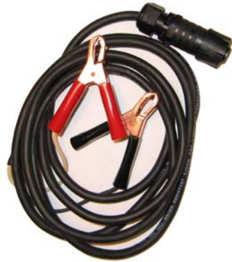
12 Volt Power Cable