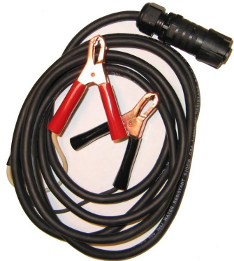
12 Volt Power Cable