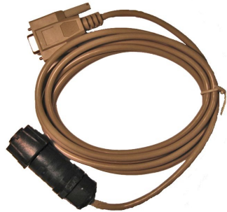
Serial Port Cable