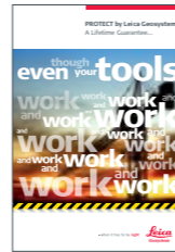
PROTECT by Leica Geosystems Brochure