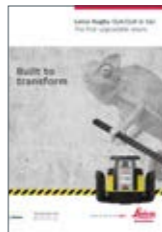
Leica Rugby CLA/CLH/CLI Brochure

Illustrations, descriptions and technical data are not binding. All rights reserved. Printed in Switzerland - Copyright Leica Geosystems AG, Heerbrugg, Switzerland, 2018. 812719en - 08.18