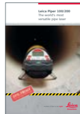
Leica Piper 100/200 Brochure