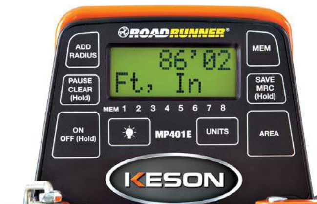
50% OF ACTUAL SIZE

Backlit 7 Digit LCD display for low-light usage. Up to 99,999 feet, 11 inches or 99,999.9 in tenths and metric.