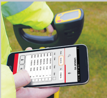
Download and transfer data in the field with LOGiCAT VU app