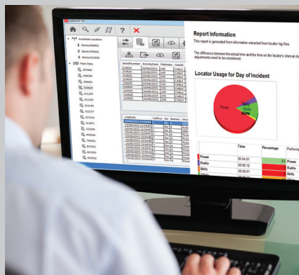
Analyse your fleet centrally