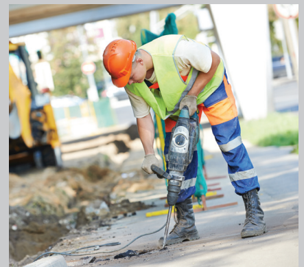
Reduce utility strikes and keep your staff safe

The Bluetooth® word mark and logos are registered trademarks owned by Bluetooth SIG, Inc. and any use of such marks by Leica Geosystems is under license. Other trademarks and trade names are those of their respective owners.