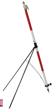
5214-01 — Gardener Rod Rest 1.25-inch OD