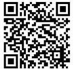
Part No. 5182-001